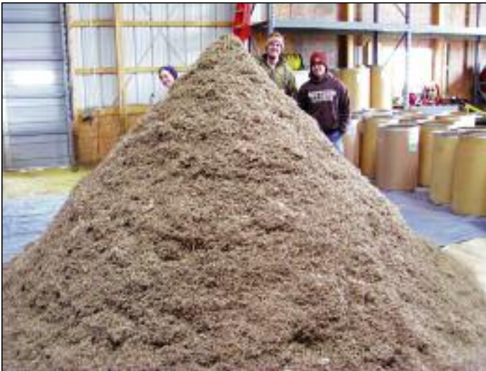
1,532 lbs of Dry Mesic Mix

Crew: 40 acres 80 acres FCNA: 8 acres ----- Volunteer Stewards: 20 acres 82 acres Total: 68 acres 162 acres Acres seeded in 2008: 230 acres