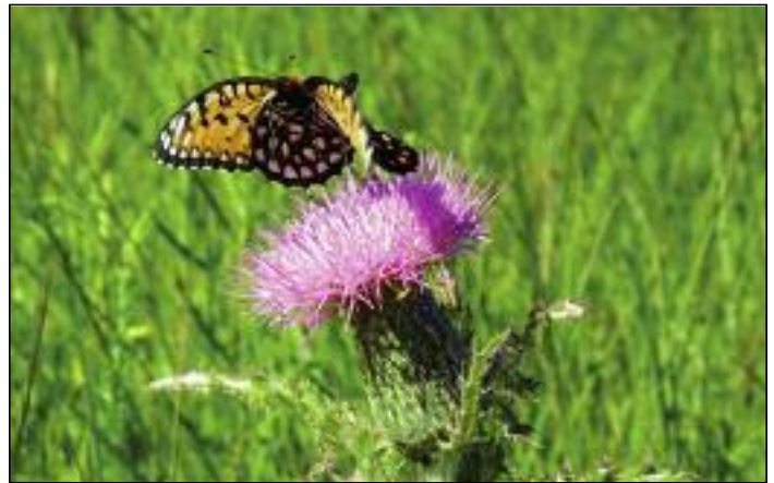
A rare Regal Fritillary lifting off the rare Hill’s Thistle.

bluestem and Indian grasses; they were most welcome to touch and feel the textures of our native wildflowers. Eventually this led to their participation in seed collecting, and later, planting the harvested seeds. Always students want to see animals, and we find them in the form of insects (grasshoppers), small invertebrates like earthworms, and birds. Sometimes we see deer, and we encounter an ornate box turtle several times a year, in the spring. A hawk carrying off a snake convinced one girl that Nachusa is a wondrous place, and she volunteered to help me after school for many weeks and a summer. We are likely to discover scat, or some kind of footprints, left by a retreating animal. That evidence, with my mammal field guide showing paw print shapes and sizes of, say, round, 4-clawed and 1 ¾ inches long, will indicate that a red fox was here. Dangerous? No.