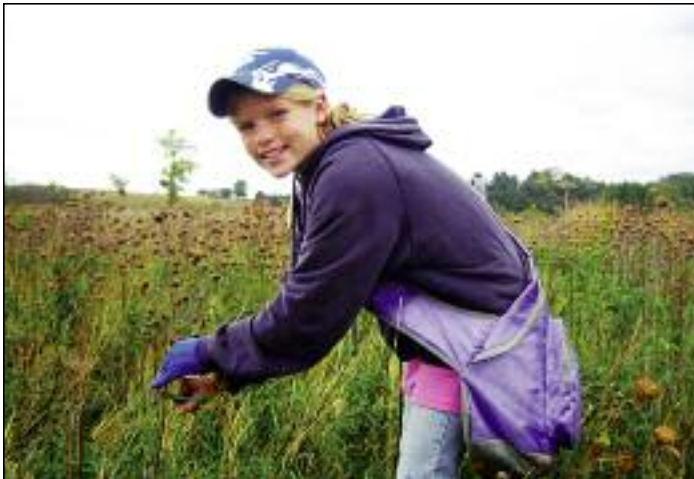
Youth steward collecting seed.

Nachusa Grasslands volunteers run an educational program to connect local students with stewardship and restoration of our natural communities. The Youth Stewardship Program began in 1997 with impetus from volunteer stewards and a kickoff grant from Crest Foods of Ashton.