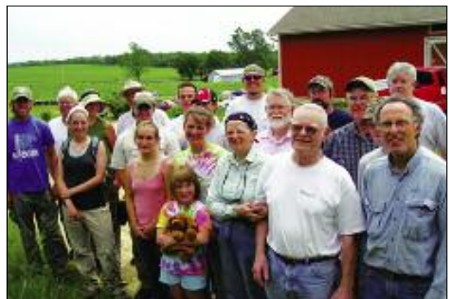
Typical summer day – stewards of Nachusa.

No mix is complete Without All of the Laughing, chuckling Murmuring, muttering, Sneezing, wheezing, Grumbling, groaning, Weeping, wailing Sobbing, sighing Yawning, snoring, Scowling, howling Whispering, shouting, Singing, Celebrating, Sounds of the people.