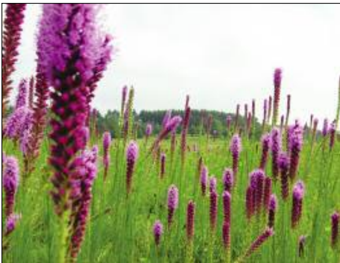
Gay Feather Patch