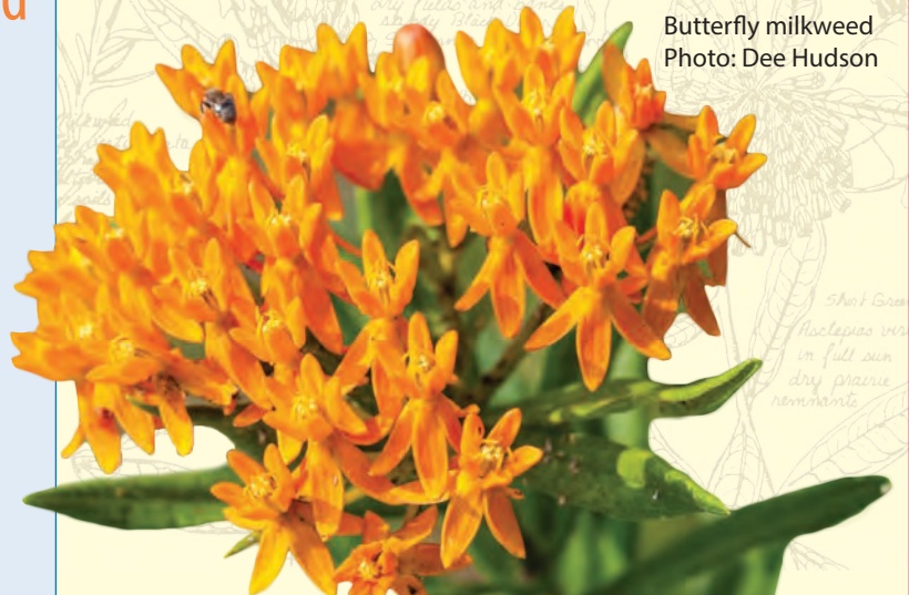
Butterfly milkweed

Maybe you were a pioneer and had chest pain. You might look for butterfly milkweed ( Asclepias tuberosa ), nicknamed “pleurisy root,” which would be used to treat your lung inflammations and bronchial issues. Today, we appreciate it as an attractive native milkweed that hosts monarch butterfly caterpillars, and an excellent plant for the home garden.