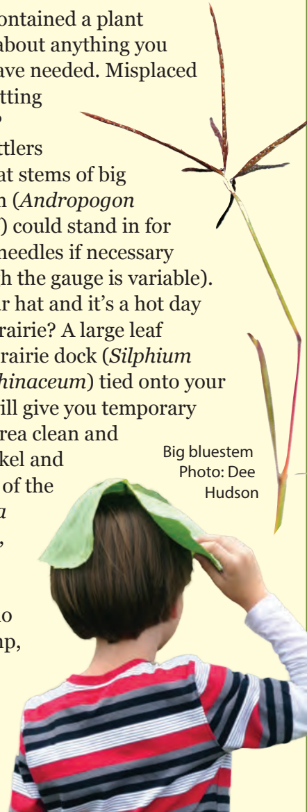
Big bluestem

Asclepias speciosa disturbed upland areas