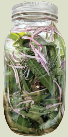
Pale purple coneflower cold infusion tea

everything from juice for burns to the chewed root for toothaches, and used preparations from coneflowers to fortify the body against infection from colds and diseases. Today, drinking medicinal Echinacea tea (often paired with lemon, slippery elm, or elderberry) is believed by some people to strengthen the immune system (although those with certain plant allergies may have severe reactions to the plant). Echinacea tea is easily found in most grocery and health food stores. 🌿