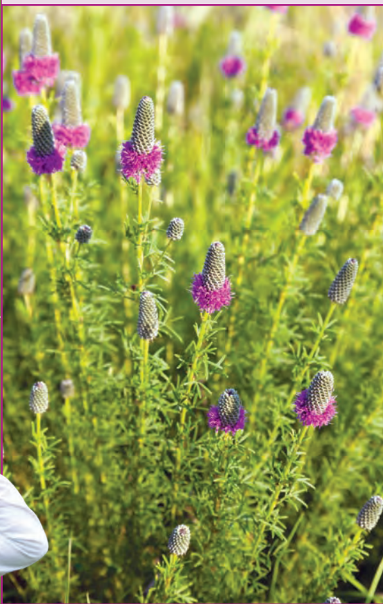
Purple prairie clover.

These are only a few stories of the prairie plants that have influenced our history in "The Prairie State" of Illinois. The tallgrass has so many more stories to tell us about how our lives and those of prairie plants are closely intertwined. Why not investigate and see what other interesting tales you discover? 🌿