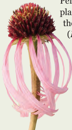
Pale purple coneflower

Perhaps the best-known medicinal plants of the tallgrass prairie are the Echinaceas : purple coneflower ( Echinacea purpurea ), pale purple coneflower ( Echinacea pallida ), and other species of this genus. Many sources tell us how some Indigenous people found parts of the pale purple coneflower useful in pain relief from