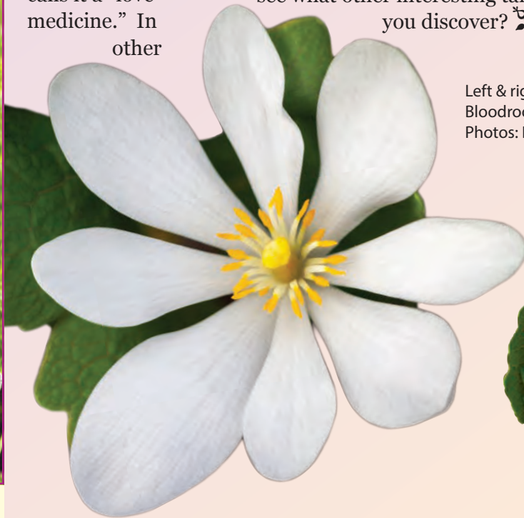
Left & right: Bloodroot