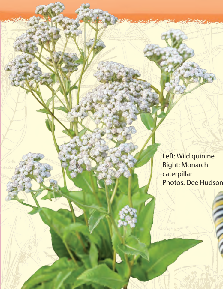
Left: Wild quinine Right: Monarch caterpillar