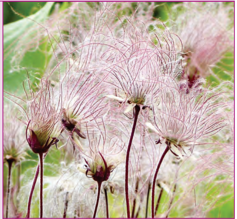
Prairie smoke.

the root of wood betony ( Pedicularis canadensis ), when eaten, was supposed to end quarrels between lovers. Moerman calls it a "love medicine." In other