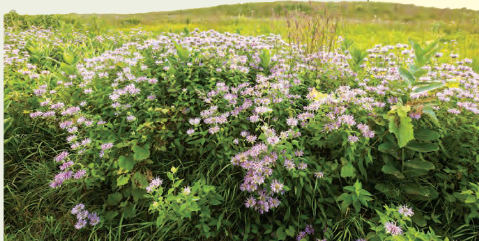
Wild bergamot at Thelma Carpenter Prairie.