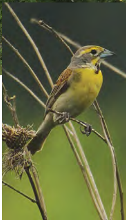
DICKCISSSEL (SPIZA AMERICANA) ⚓