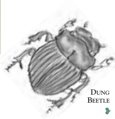
DUNG BEEBLE ⚓