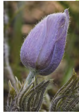
PASQUE FLOWER ✧ ( ANEMONE PATENS )