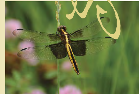
FEMALE WIDOW SKIMMER ⚓ (LIBELLULA LUCTUOSA)

Nachusa was always a place of hope for me. Every prescribed burn, every new growing season, and every new restoration project provided a sense of hope and possibility for what new things would come. As the years have passed, the sense of possibility grows every year. I remember feeling the excitement of the new land purchases like Sand Farm and Tellabs Savanna... now those parcels are dwarfed by more recent land purchases. I remember feeling the excitement of finding the first few eastern prairie fringed orchid plants... now that population exceeds one-hundred plants. Now, as I hear about the plans for returning bison to Nachusa, my sense of hope for the future is stronger than ever, and then I wonder what will be possible in the decades ahead.