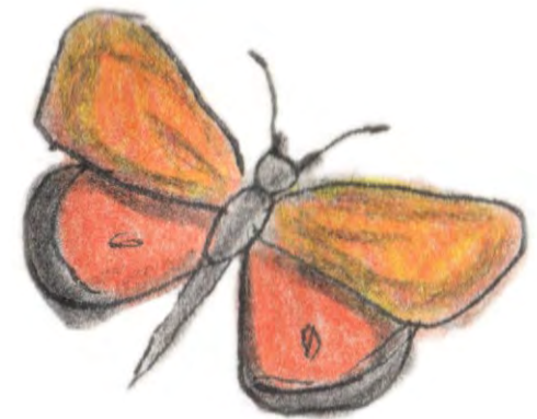
LEAST SKIPPER (ANCYLOXYPHA NUMITOR)

We are joined as we labor, Souls sustained, eyes enriched. There is more. Can we do it? Can we not, stitch by stitch, Make this ever more vibrant? With protection, affection, Strength enlarged in the giving, We are stitching an heirloom, On this land, in this place – Nachusa