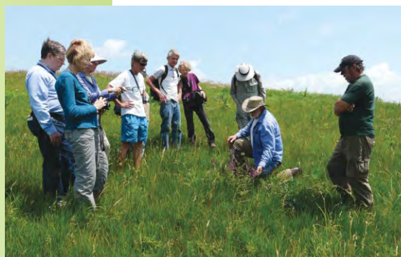
SIERRA CLUB VISIT TO NACHUSA

Transform a Cornfield into a Native Landscape: Volunteer to be a Steward of your very own unit and participate in this leading-edge experiment in the new science of restoration ecology.