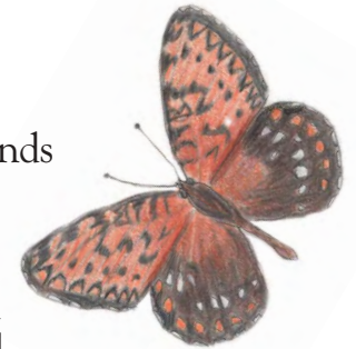
REGAL FRITILLARY ( SPEYERIA IDALIA )

The goal of the Nachusa Grasslands Stewardship Endowment, invested and managed by The Nature Conservancy (TNC) in accordance with its policies and procedures, is to support the conservation and preservation of native plants, animals and natural communities by providing funds for long-term stewardship at Nachusa Grasslands.