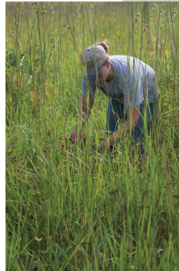
SEED COLLECTING ★