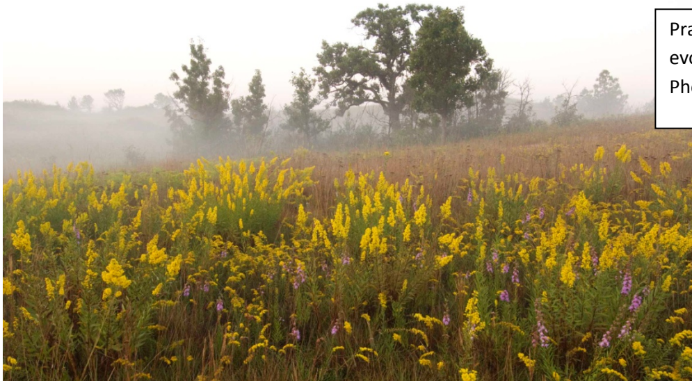
Prairie, wetlands, and woodlands evolved with and depend upon fire.