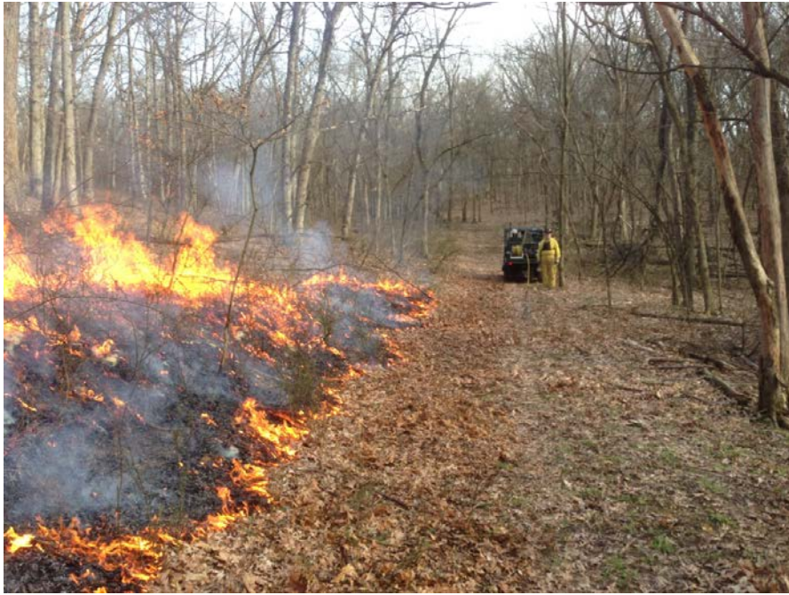
First fire in the Orland Prairie north "Panhandle".