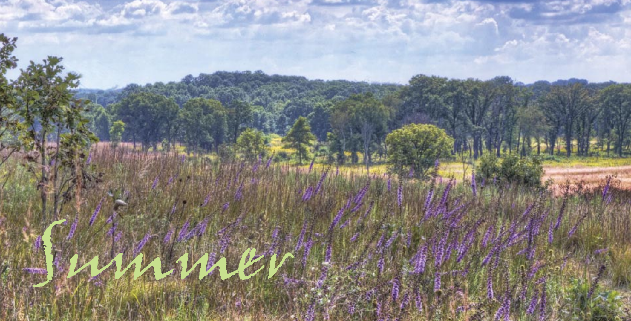
ROUGH BLAZING STAR ON DOUG'S KNOB ★