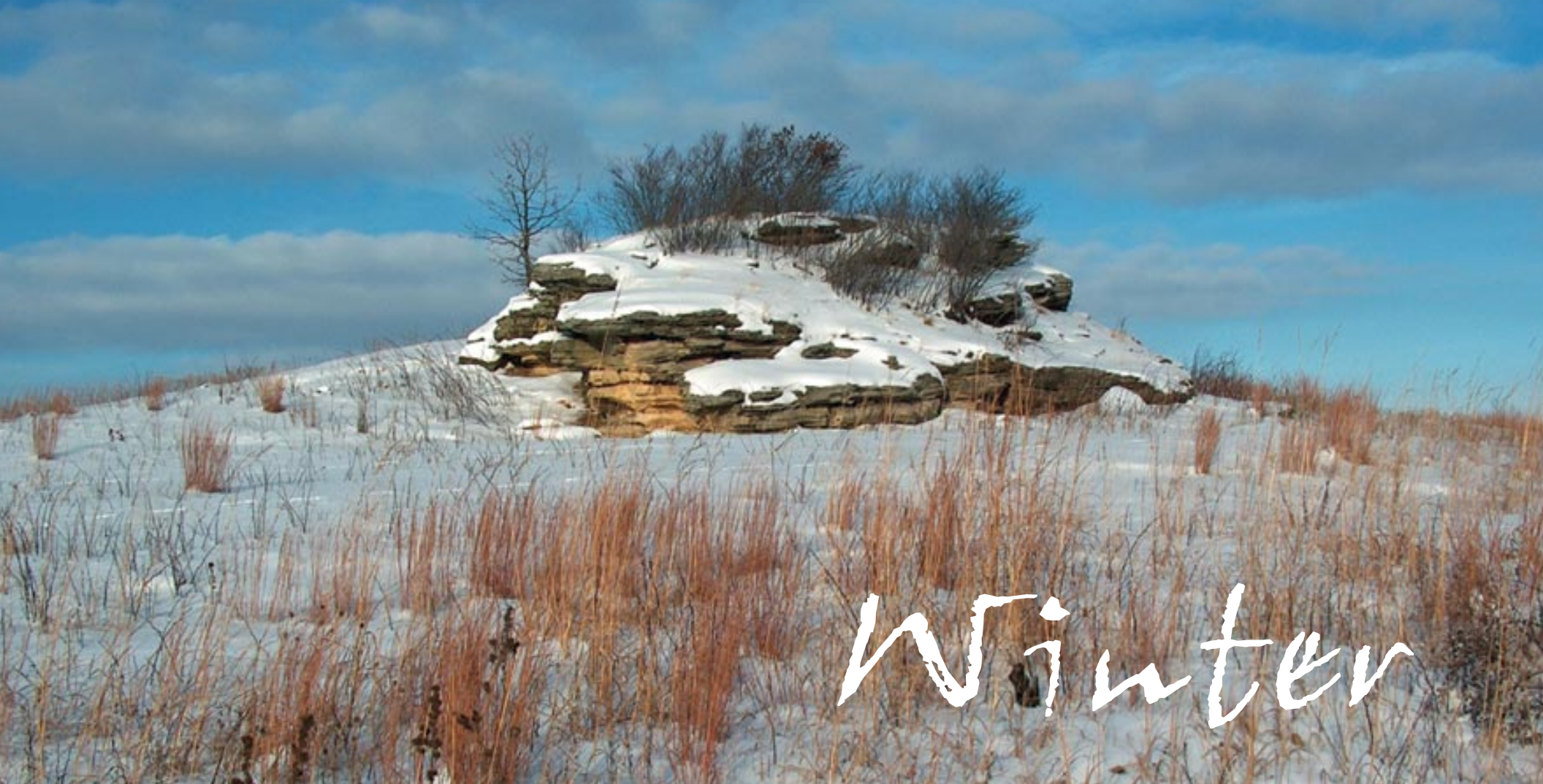
COYOTE POINT ♥