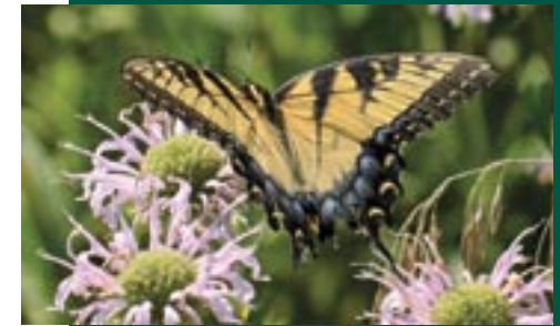
TIGER SWALLOWTAIL ↓

"...the joy of prairie lies in its subtlety. It is so easy—too easy—to be swept away by mountain and ocean vistas. A prairie, on the other hand, requests the favor of your closer attention. It does not divulge itself to mere passersby."