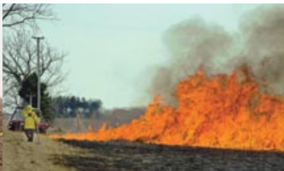
PRESCRIBED FIRE ★