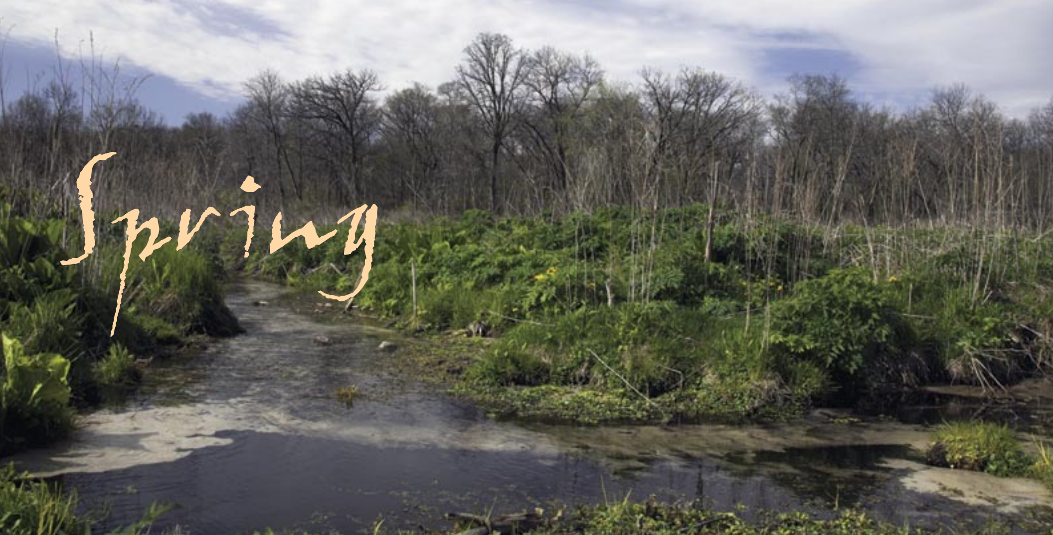
SAND BOIL IN THE FEN ★