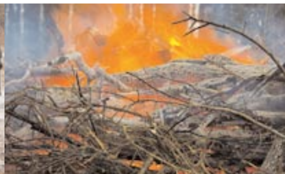
BRUSH PILE FIRE ★