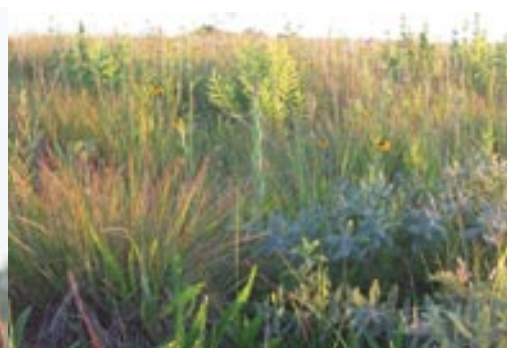
PRAIRIE SPECIES FLOURISHING ON THELMA CARPENTER RESTORATION ★