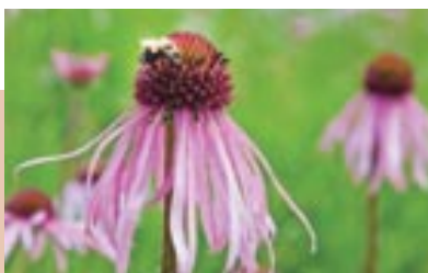
BEE ON PALE PURPLE CONEFLOWER ↓

Friends of Nachusa Grasslands 8772 S. Lowden Road, Franklin Grove, Illinois 61031 708-406-9894 nachusagrasslands@gmail.com