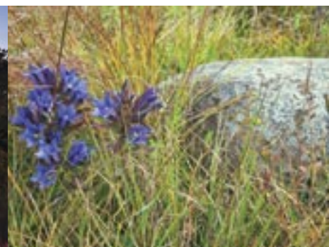
PRAIRIE GENTIAN ★