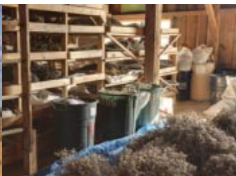
SEED ROOM OVERFLOWING WITH THE FALL HARVEST ★