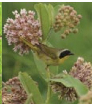
COMMON YELLOWTHROAT ⚡