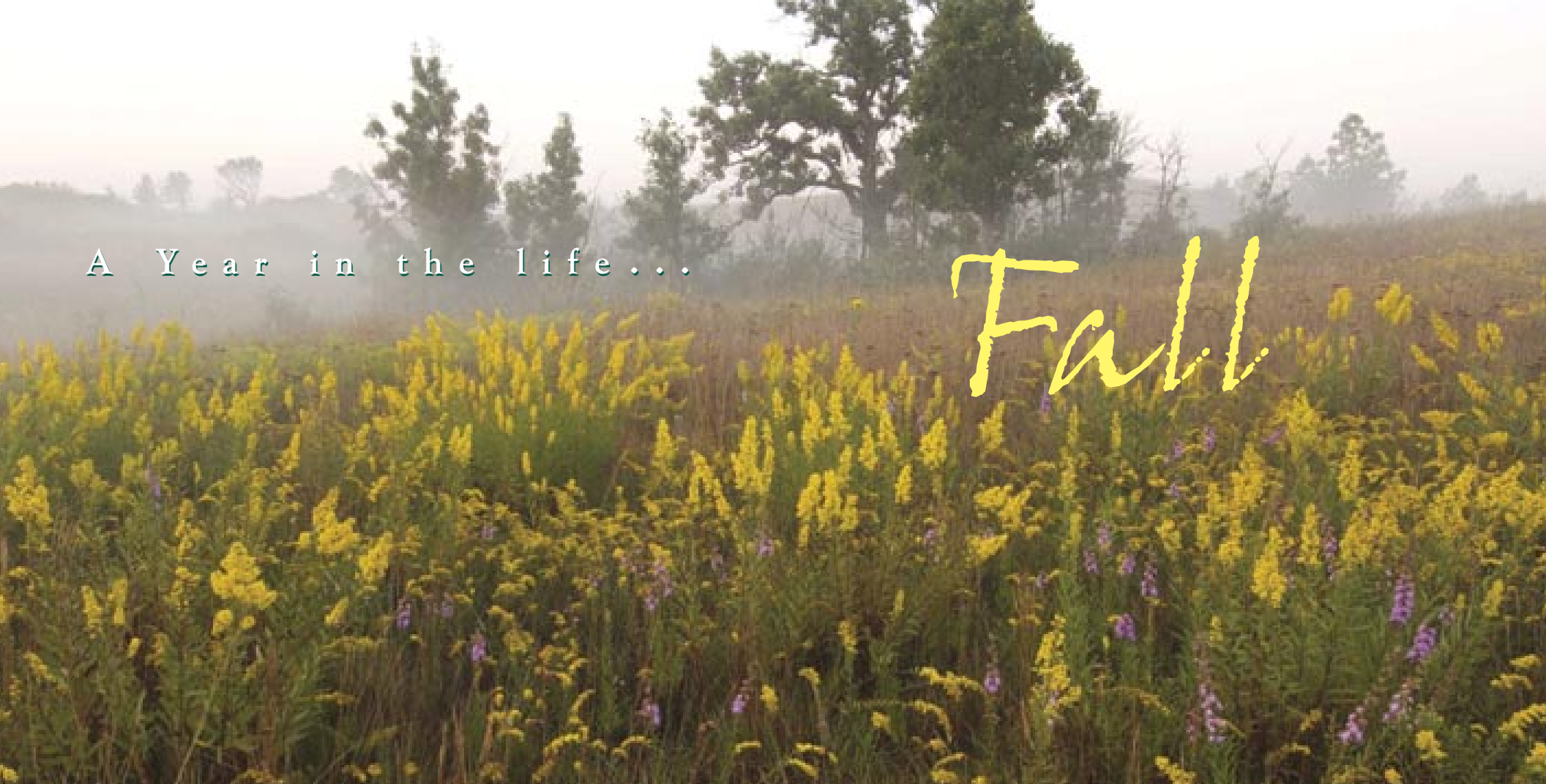
FOG BEFORE SUNRISE ❖