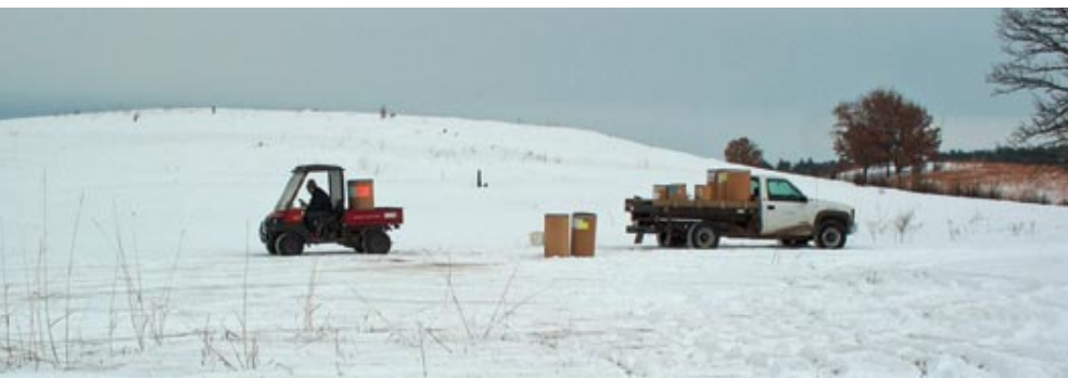
PLANTING IN THE SNOW ♥