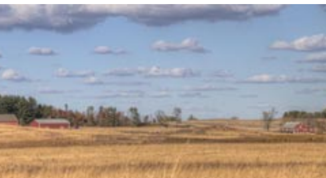
BROWNING GRASS DOMINATES THE MAIN UNIT ★