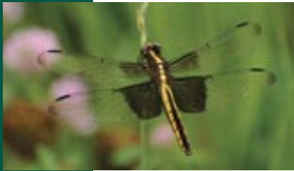
FEMALE WIDOW SKIMMER ↓

Nachusa Grasslands is a leader in restoring one of the world's most endangered ecosystems.