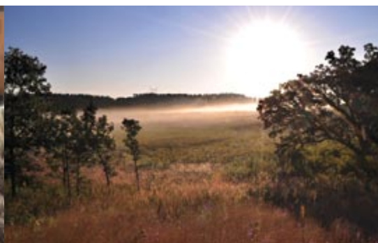
GRASSLAND SPLENDOR IN EARLY FALL ❖