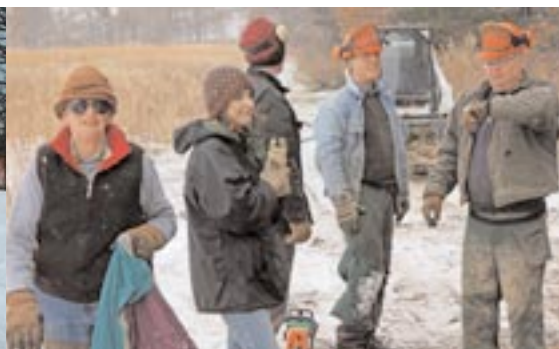
WINTER WORKDAY BREAK TIME ★