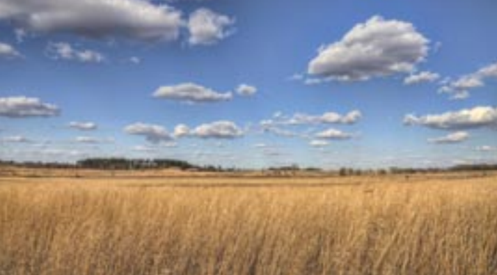
AUTUMN PRAIRIESCAPE ★