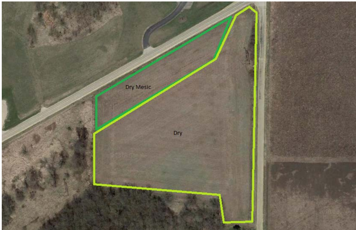
Figure 4. Map showing where the dry and dry mesic seed mixes were planted.