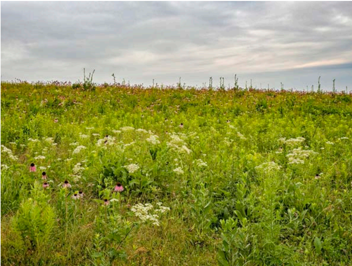
This prairie is on the loop trail at the Visitor Center.