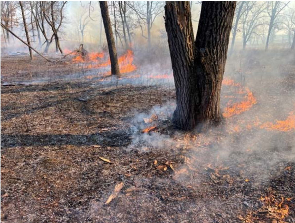
Above, Big Woods unit burning well. The flame lengths are modest but these fires set back the brush and support the ground layer plants, and the fires sustain the oak and the hickory which do well with sunshine.