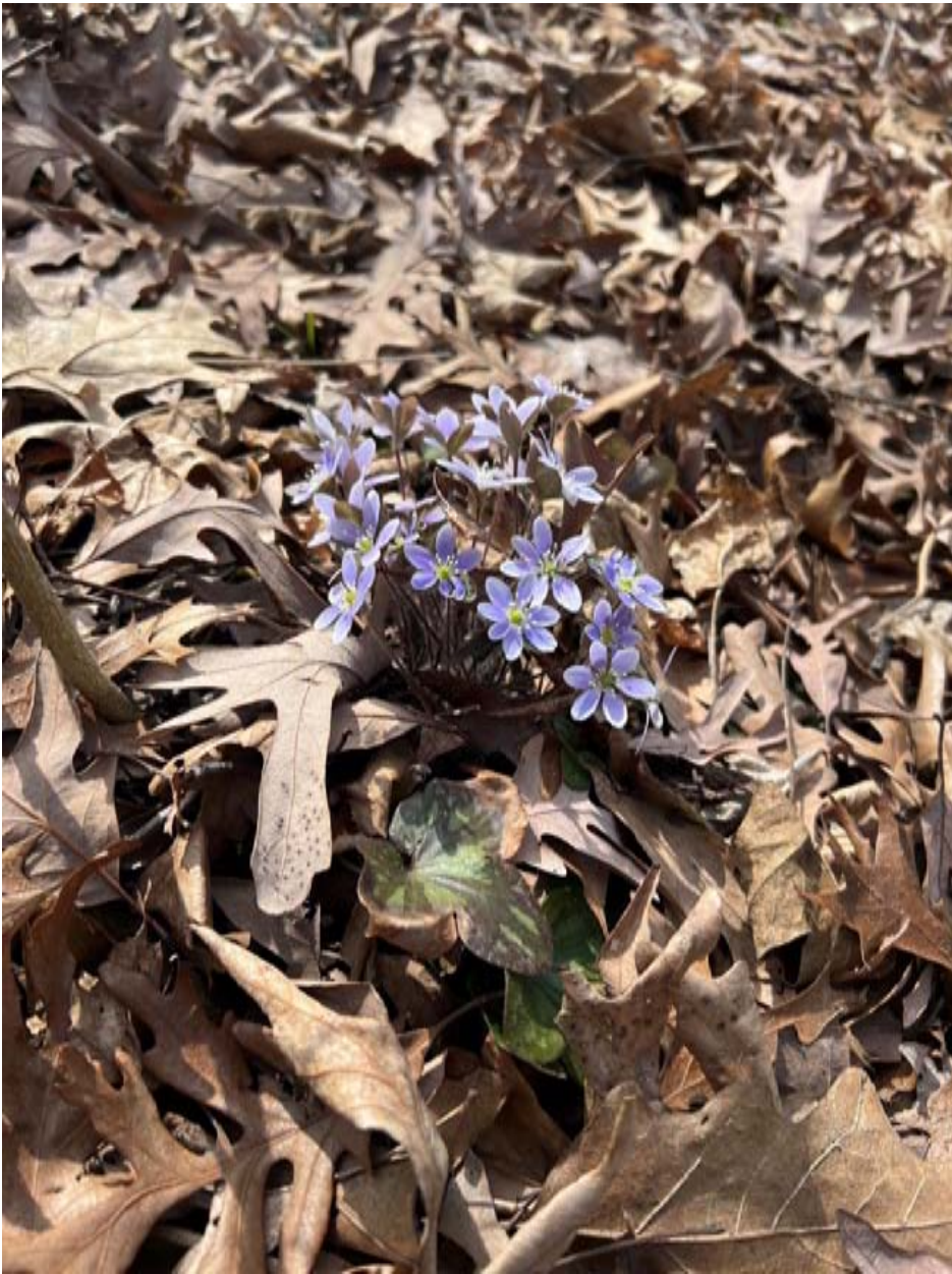
In the same woods these lovely hepatica bloom in the oak litter.