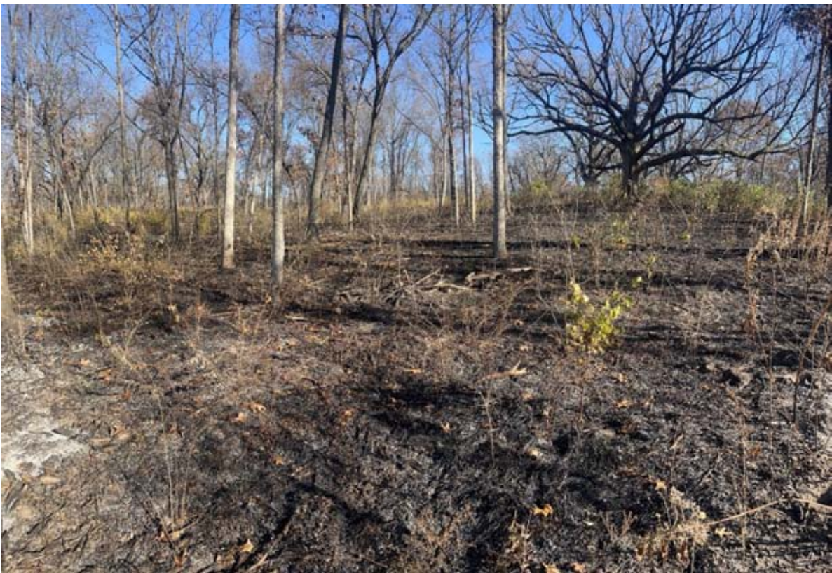
A day after the Hill Site fire with shrubs top killed by the heat but an old bur oak stands sentinel, that tree perhaps is old enough to have had Native American fires run past.