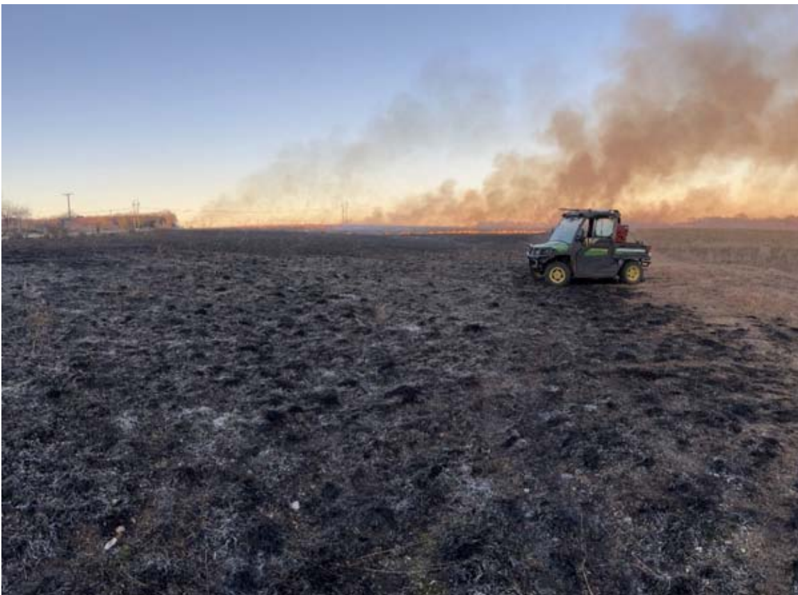
We use UTVs with water pumps that spray efficiently at several gallons per minute with high pressure. Want to read more about UTV water pumpers? https://grasslandrestorationnetwork.org/2024/03/14/rx-fire-pumper-units-and-tenders/