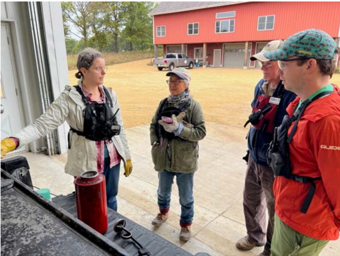
We did an annual fire refresher in the fall. This helps crews pick up details, increase cohesion and sustain a fire culture of excellence.