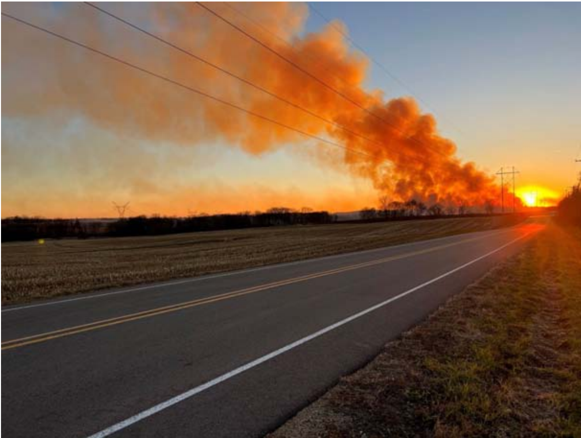
Finishing at sunset with good smoke lift.