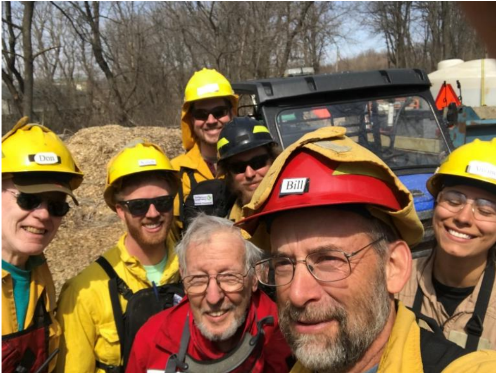
Below: The April 9 fire ran into the evening as the fire slowly worked its way around the interior woods.