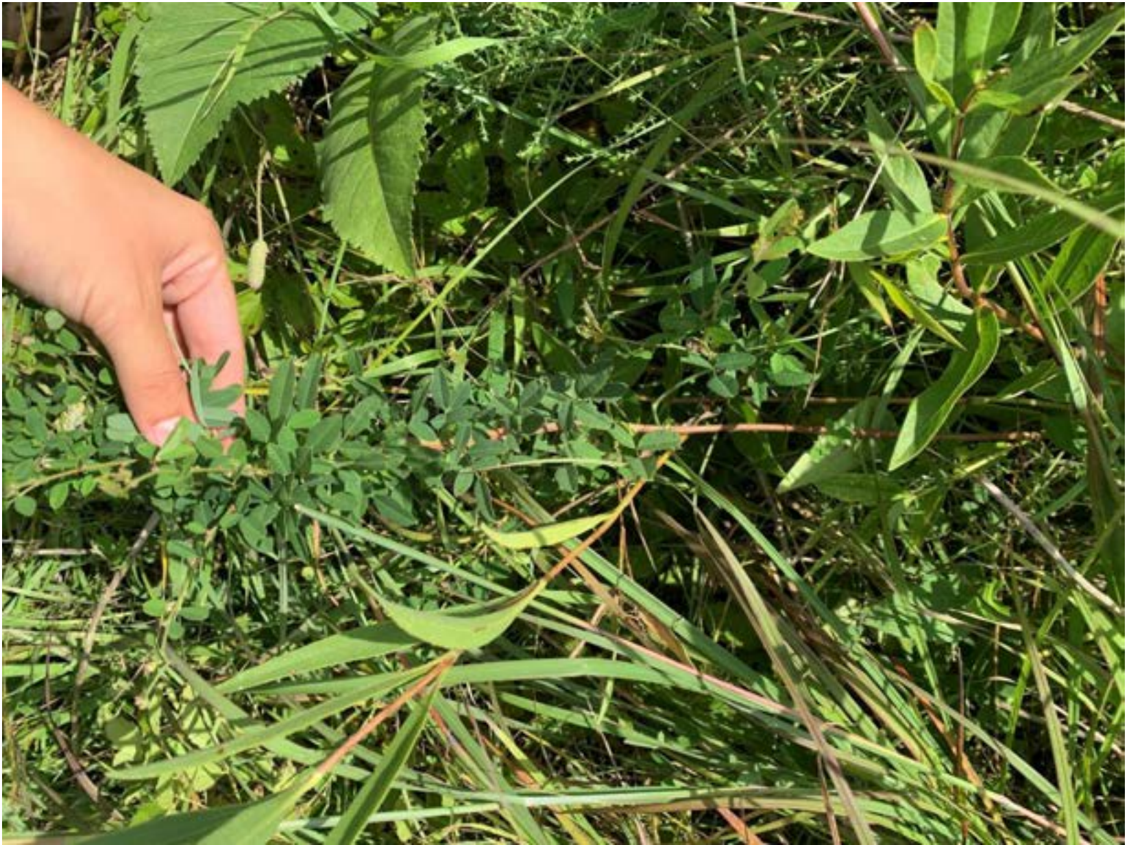
L. daurica sprawling w red tint on stem. Not all plants have the red tint.