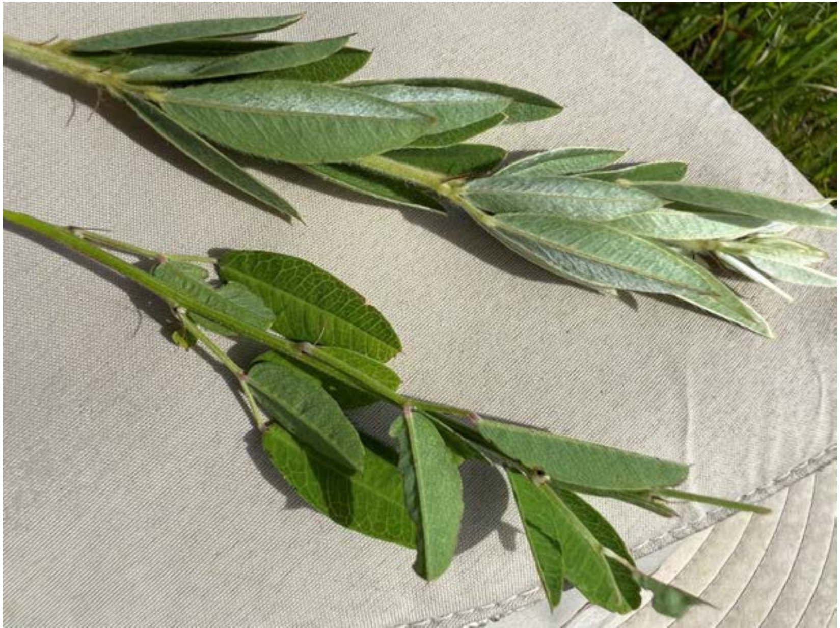
L. capitata top (fuzzy leaves and stem) vs L. daurica lower (longer leaf petiole common, not much fuzz)