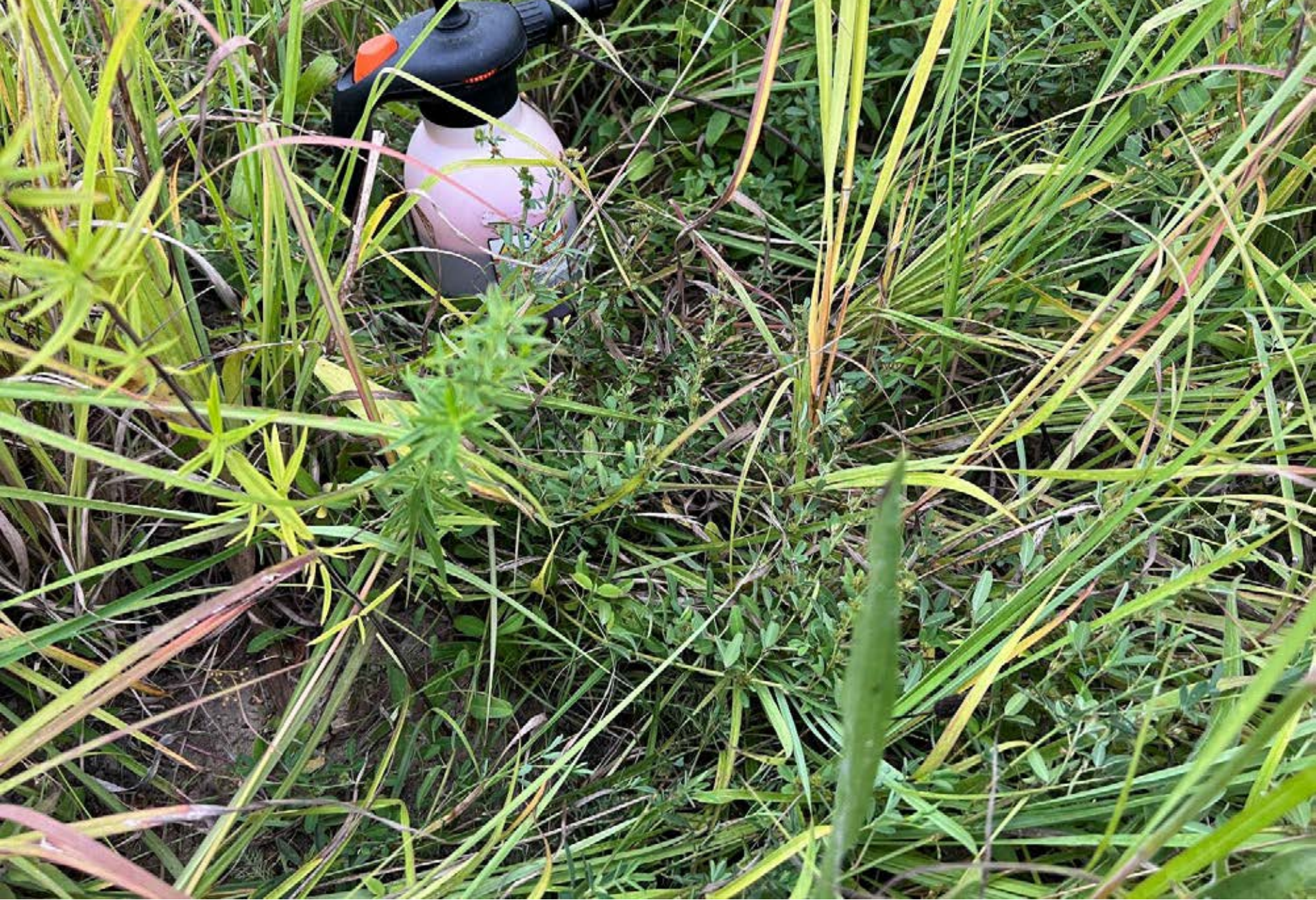
Another view of the way L daurica sprawls on the ground