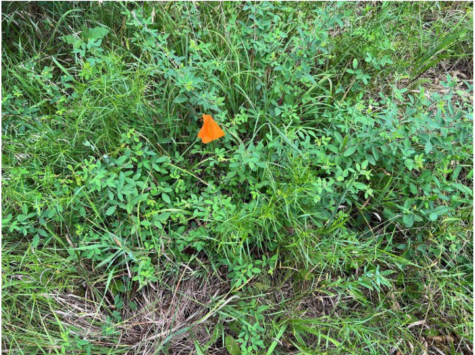
L. daurica sprawling out