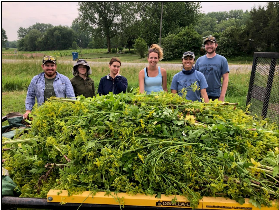
Photo C. The crew poses next to their wild parsnip haul at Green River State Wildlife Area