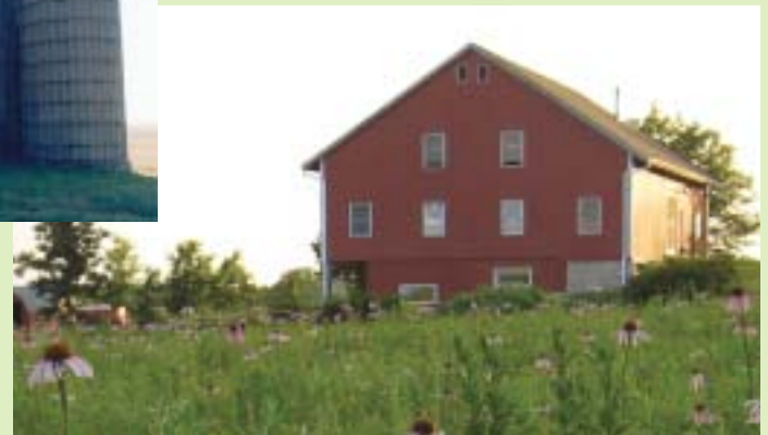
NOW: NEW HEADQUARTERS BARN ☼