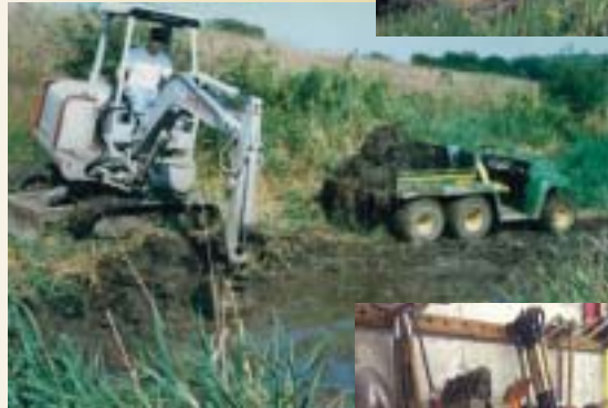
TODD BITTNER IN THE MINI-TRACK HOE WITH GATOR, 1995 ✪