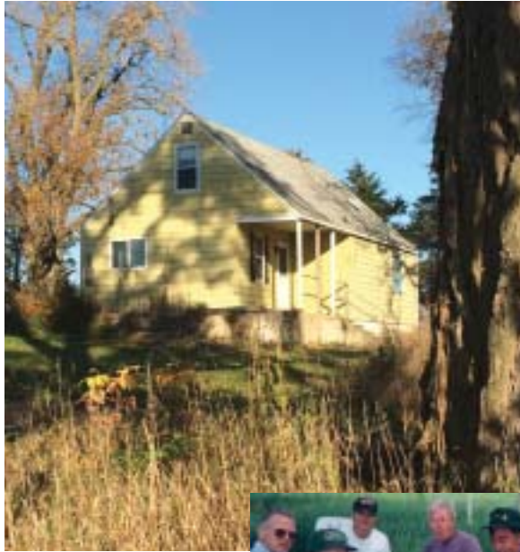
YELLOW HOUSE ♦