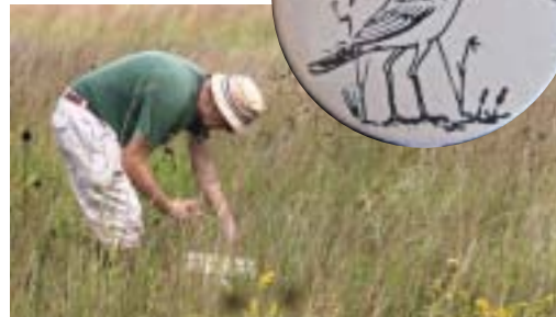
RAY DERKSEN, SEED COLLECTING. ★