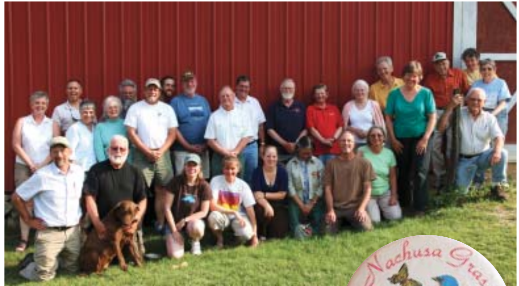
FRIENDS OF NACHUSA GRASSLANDS ANNUAL MEETING 2014 ★

Over the past twenty-eight years, hundreds of concerned people have invested thousands of hours protecting and restoring remnant prairie at Nachusa Grasslands. Although many more years of effort lie ahead, Nachusa is already one of the most successful restorations in the world. We have now begun to provide for its long-term survival.