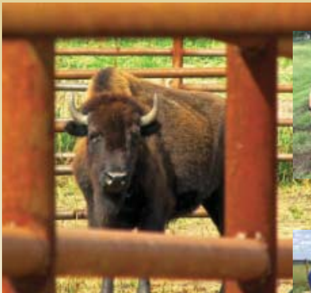
BISON, 2014 ❁

And yes – even then, we were thinking bison , not cows , as the better grazer that would eat the grass, allowing this rare plant to thrive. Now, we'll see.