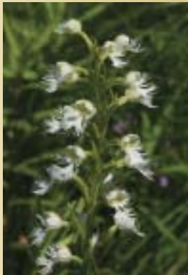
EASTERN PRAIRIE FRINGED ORCHID