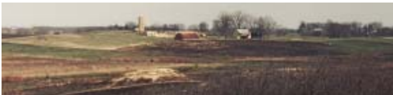
THE YELLOW HOUSE IN THE DISTANCE, 1992 ❁