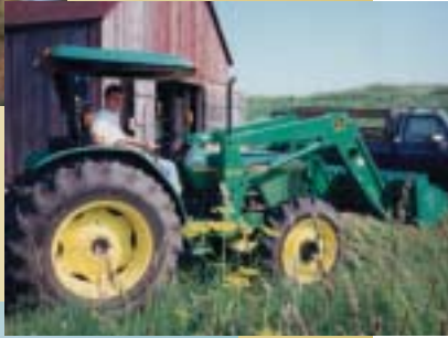
ROD SCHICK IN THE LOADER TRACTOR, 1994 ✪