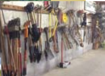
TOOLS IN THE BARN, 2014 ★