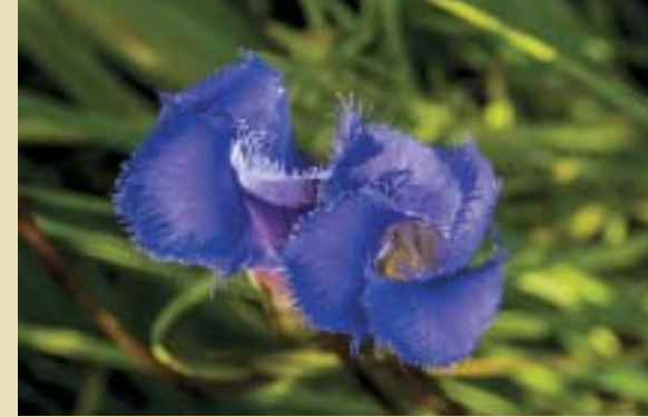
FRINGED GENTIAN OPENING ☆