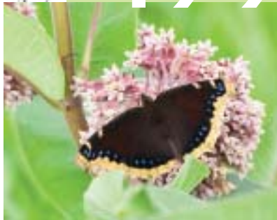
MORNING CLOAK +