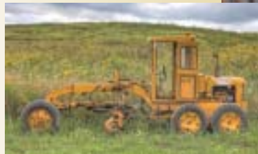
ROAD GRADER, 2012 ✪