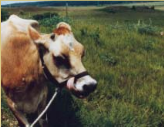
NEHRU, 2001 ❁

...Nehru was grazing a mile south of the barn. I saw what looked like a dead cow!