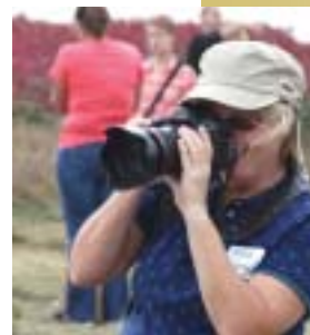
DEE HUDSON CAPTURING THE MOMENTS ★