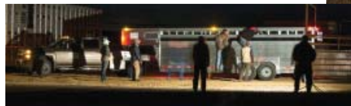
THE BISON HAVE ARRIVED. +