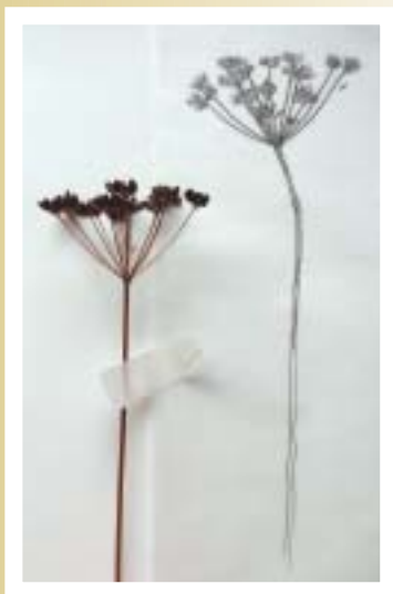
GOLDEN ALEXANDER ✧

TNC's AUTUMN ON THE PRAIRIE CELEBRATION: September 19, 2015