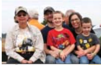
MEIER FAMILY IN WAGON ★