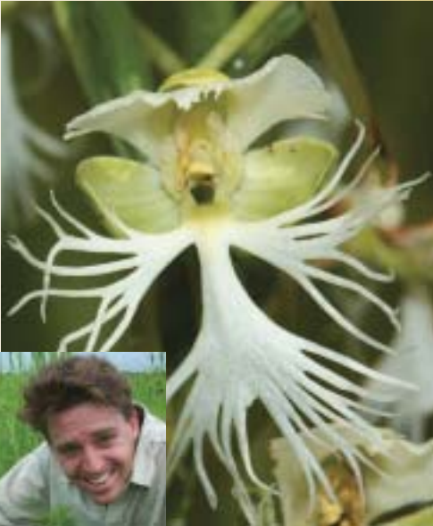
EASTERN PRAIRIE FRINGED ORCHID

I am humbled and honored to be one of their stewards.