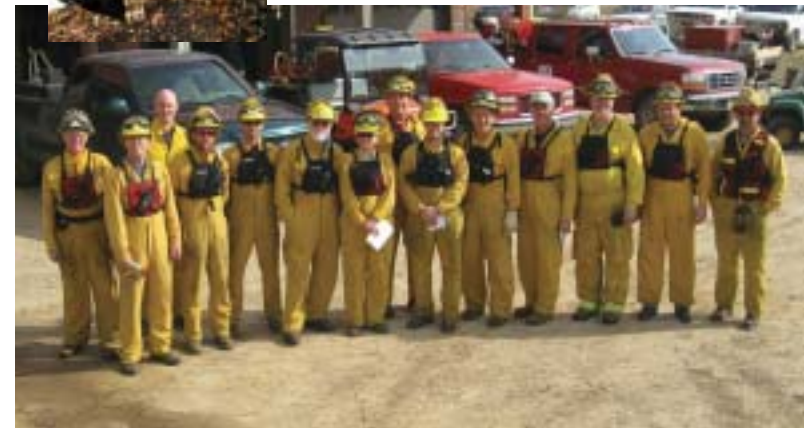
2010 FIRE CREW ❁