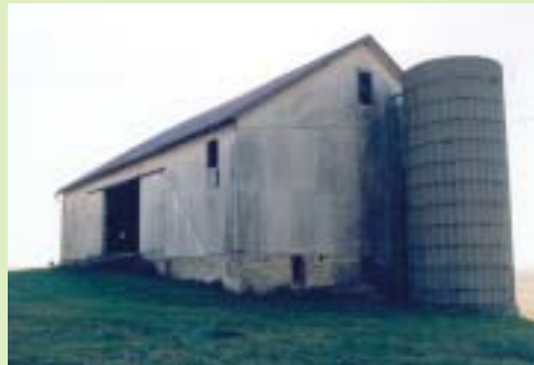
THEN: OLD HEADQUARTERS BARN, 1998 ☼

The mission of the Friends of Nachusa Grasslands is to build endowments that will help defray the cost of natural areas management, staff and operating expenses; conduct and encourage stewardship; and support education and scientific activity at the preserve.