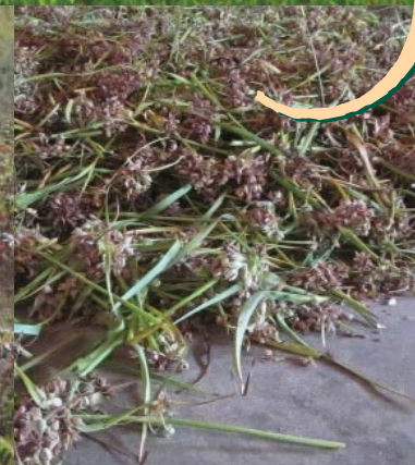
SPIDERWORT SEED HEADS ▲