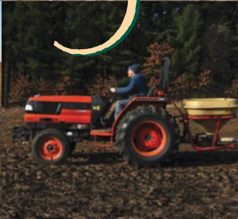
AL WITH PENDULUM SEEDER *