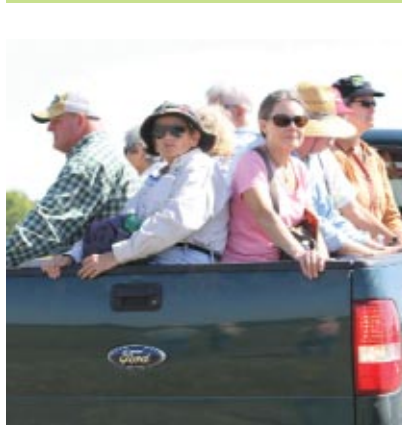
READY FOR A TOUR ★

Celebrations occur throughout the year, most notably at the Friends Annual Prairie Potluck on the fourth Saturday in June along with numerous TNC-sponsored events and get-togethers. Fellowship and fun are always part of our days (and nights) at Nachusa Grasslands.