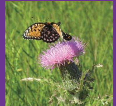
REGAL FRITILLARY ♡