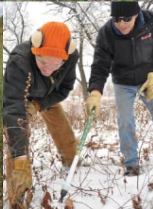
TREATING THE INVASIVES ★

Brush clearing takes place from December to May, and weeding is most intense from May to August. Invasive and non-native species are removed to allow prairie and savanna plants to flourish.