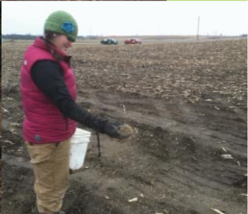
HAND PLANTING ★