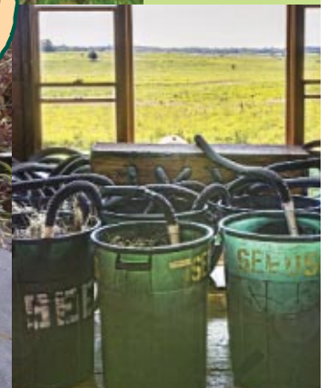
SEED DRYING OCTOPUS ★