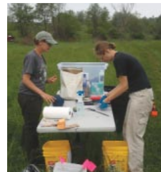
RECORDING TURTLE DATA